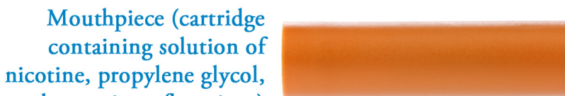
Mouthpiece (cartridge containing solution of nicotine, propylene glycol, and sometimes flavorings)